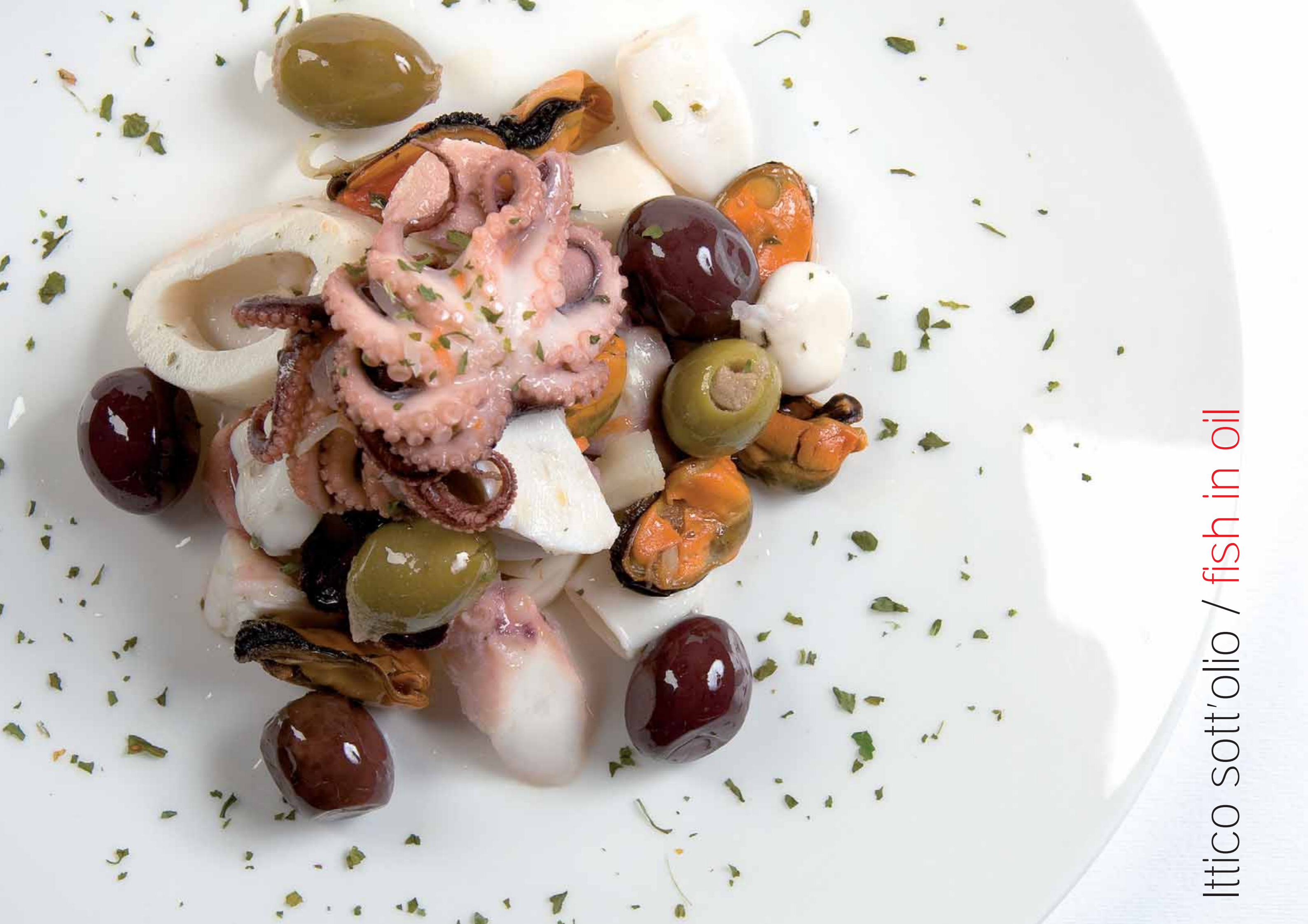
Ittico sott'olio / fish in oil